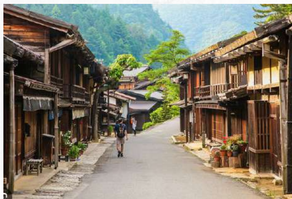
Old Nakasendo Road