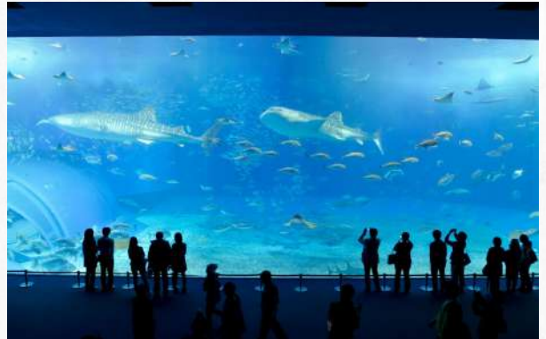
Okinawa Churaumi Aquarium

Then, we head to Cape Maeda for snorkeling at the Blue Cave, where the sunlight entering the cave reflects off of the sea bed and makes the water seem to shimmer with blue light. This area is known for its calm coves, schools of tropical fish, and some of the clearest waters in Okinawa that are enjoyed by beginners and seasoned snorkelers alike.