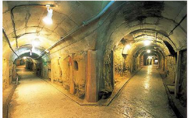
Former Japanese Navy Underground Headquarters

While there, we explore Makishi Public Market , where local vendors offer fresh produce, seafood, and everyday Okinawan favorites.