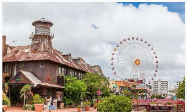
Mihama American Village