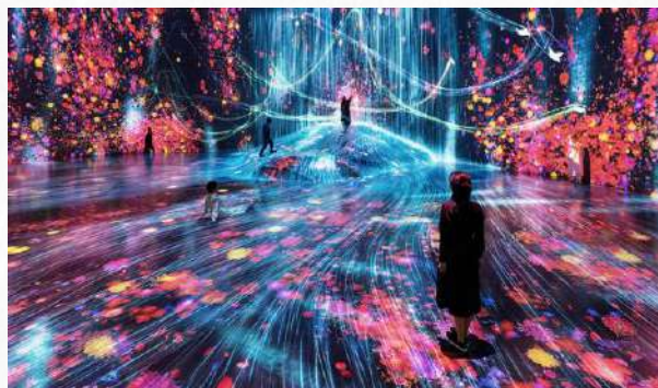
teamLab Planets TOKYO