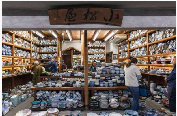
Kappabashi Kitchen Street

Today, visit the Kappabashi Kitchen Street on your own, where you can find restaurant operating products such as tableware, cutlery, and especially plastic food samples, which are seen on display in restaurant windows throughout the country. Afterwards, enjoy lunch at a conveyor belt sushi restaurant (not included) on your own.