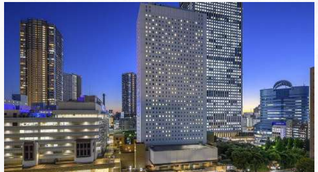
Sunshine City Prince Hotel