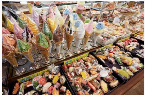
Plastic food samples