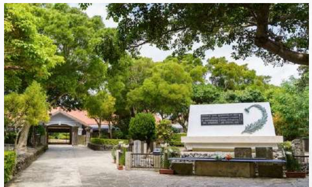
Himeyuri Peace Museum