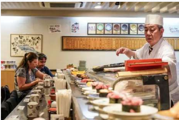
Conveyor belt sushi restaurant