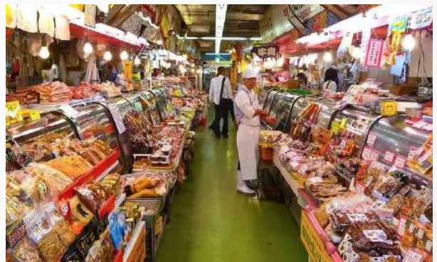
Makishi Public Market