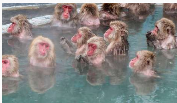
Snow Monkey Park