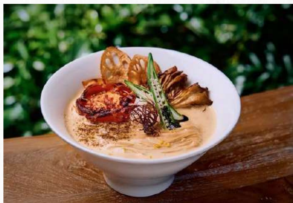
Vegan Ramen UZU Tokyo